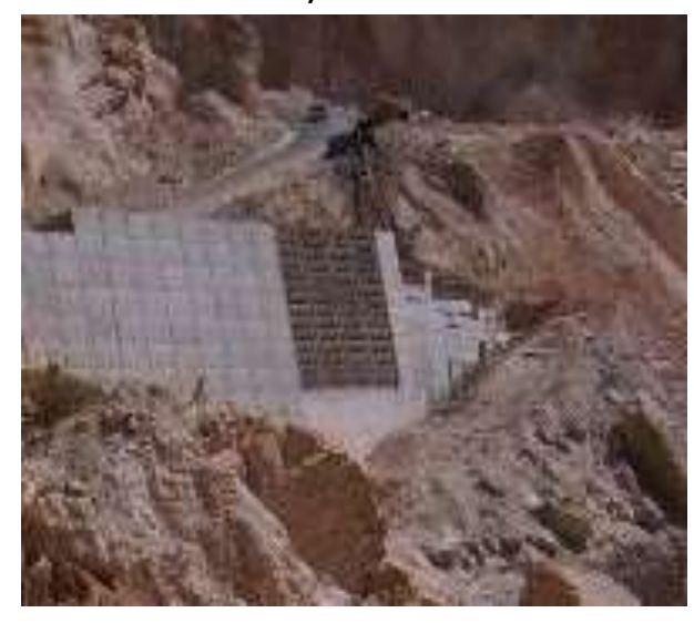
50 feet high EVERWALL gravity wall nearing completion in Yemen.