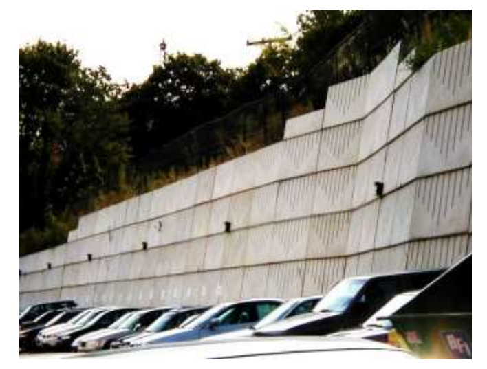
24-feet high EVERWALL for a Boston car dealership, USA

Everwalls are manufactured in NPCA Certified Quality Controlled facilities, using high density 5000-psi concrete and steel reinforcement, precast in precision steel molds, and cured under controlled conditions.