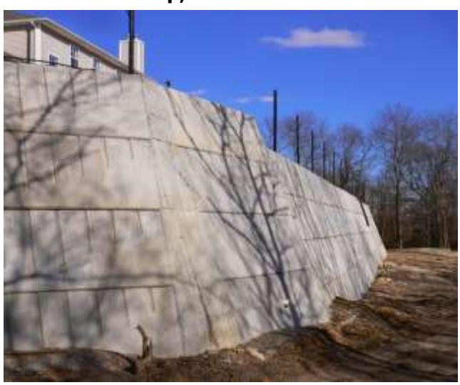
EVERWALL replacement, for a failed segmental block retaining wall, Long Island, NY, USA