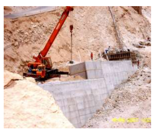
Erection of an Everwall in Khailat, Hadramout, Yemen